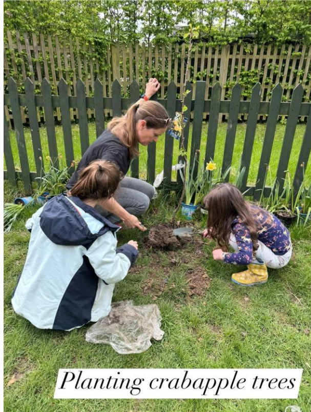
Planting crabapple trees