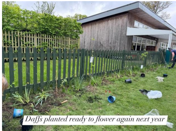
Daffs planted ready to flower again next year