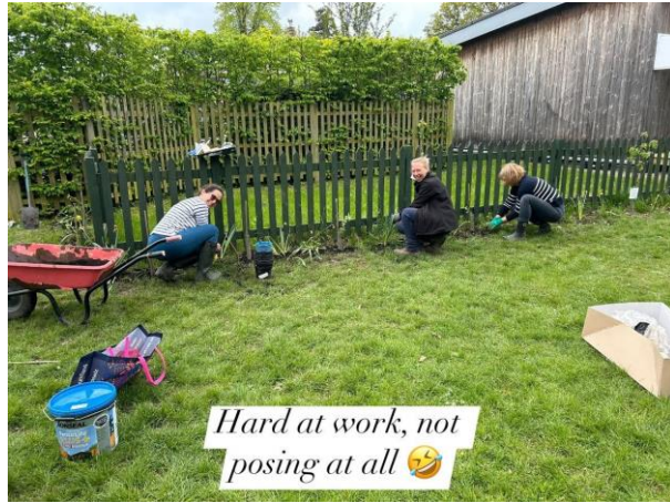
Hard at work, not posing at all 😊