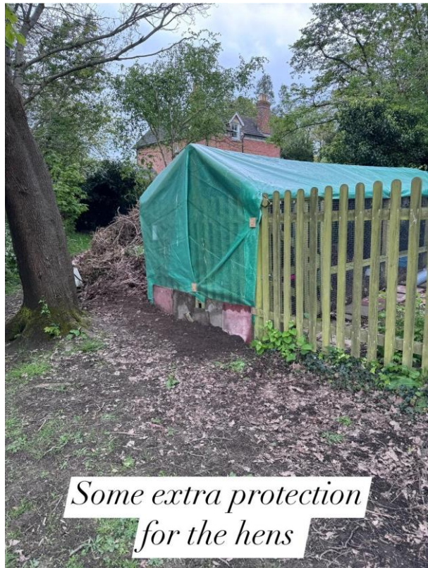
Some extra protection for the hens